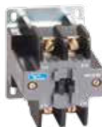
MU - 2P Contactor