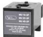
MU - 2P Coil