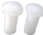
Spare ON-OFF plug