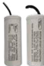
Start & Run Capacitors