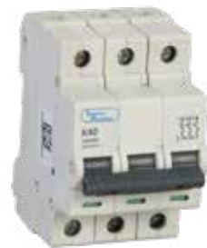
3- Pole MCB