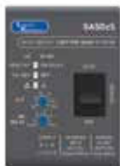
Variant compatible for 2 Button (ON/OFF) SASD STARTER