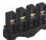
MU Contact Bridge