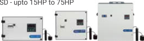
MU-GS SMART Controller