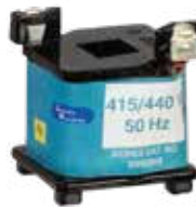
Standard Operating Coil ML1.5