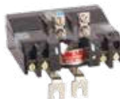
MU - 2P Relay