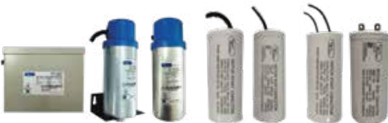
Power Factor Correction Capacitor