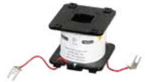
Standard Operating Coil ML2 / ML3