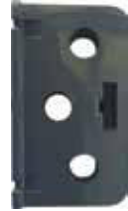
FASD CT Spare