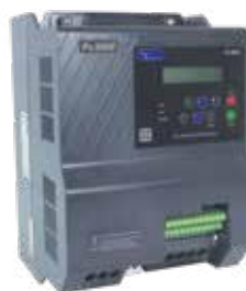
Px3000 Solar Drive Controller