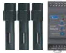
Water Level Controller