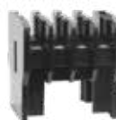
MU Spare Housing