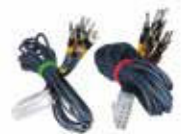
Controller-side Wire Harness & Module-side Wire Harness