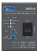
Variant compatible for 3 Button (Star-Delta-OFF) SASD STARTER