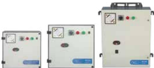
MU-G Three Phase Submersible Pump Controller

Submersible pump application, Residential pump application, Fire fighting pump application, etc.