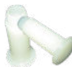
Relay Extension Knob