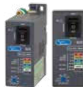
SPPR Type Sz5 (7 Wire & 6 Wire)